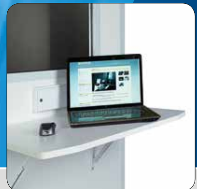
Folding table and connecting